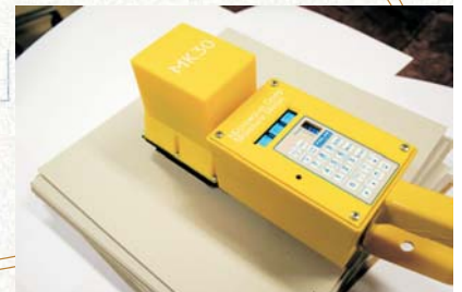
Deep Portable Moisture -- MK30