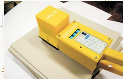
Deep Portable Moisture -- MK30