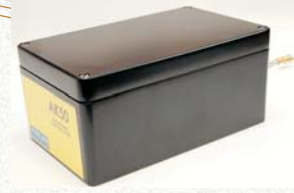
Moisture -- AK50, AK40