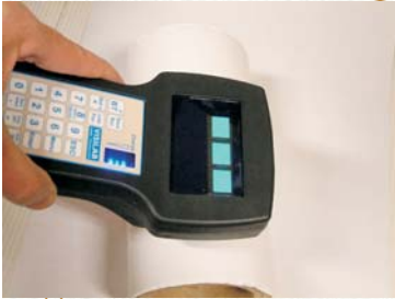
Portable Moisture -- AK30