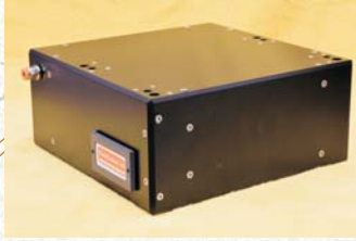
Brightness -- FrontColour 5 Colour - FrontColour 10